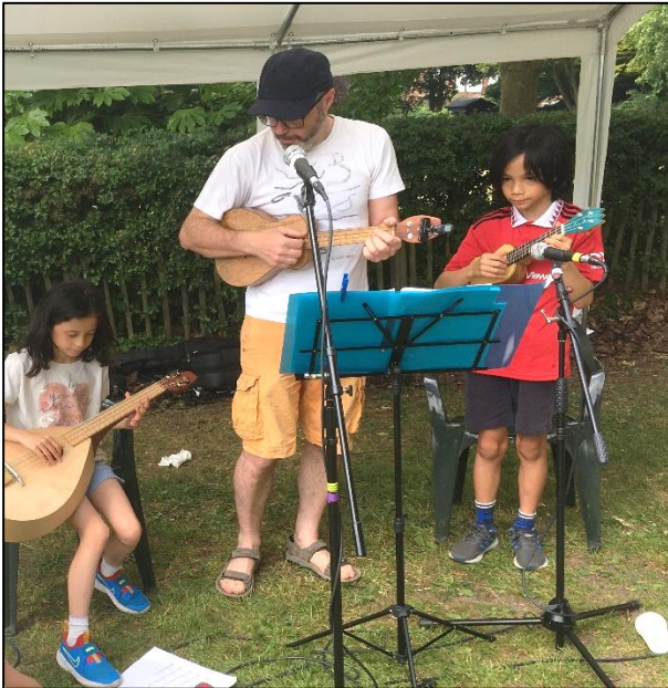
This family joined us at the Big Lunch for the jamming session. They call themselves the Desert Rabbits. Dad had made the instruments himself!