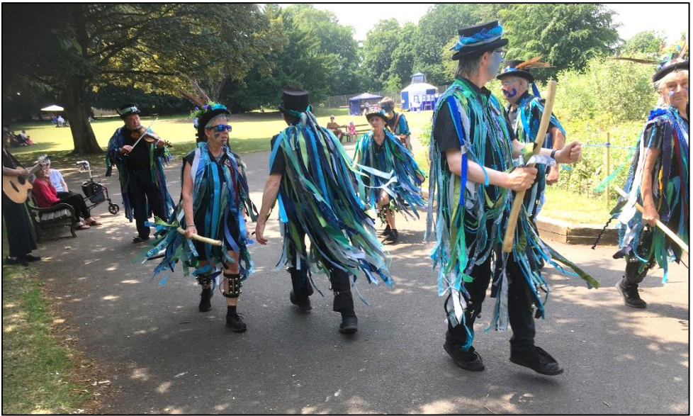
The Bollin Dancers gave us two sets of music and dancing from the generations. Their Dancing enthral – and sucks you in if you dare to join in. Just lovely.