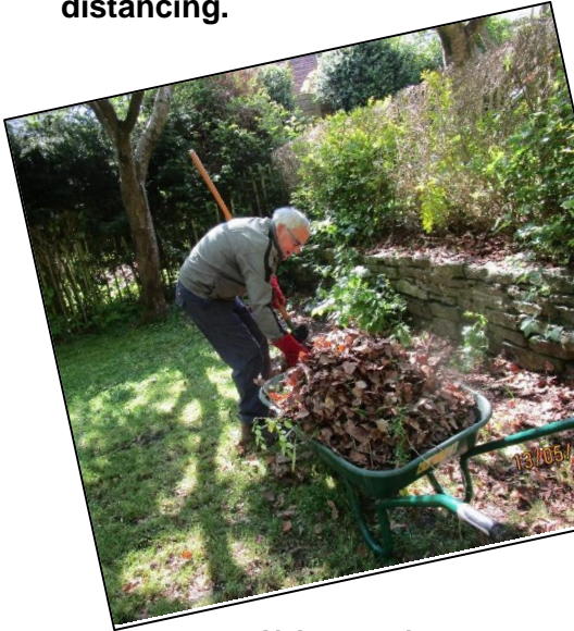
Volunteers have cleared leaves from beds and paths

We have attended to the gardens with fabulous help from volunteers offering their exercise time and maintaining social distancing.