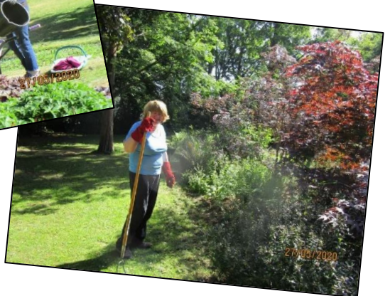
Watering has been vitally important during weeks of dry weather