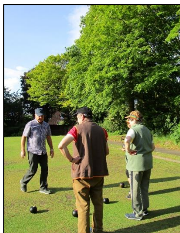
The Friends group organises social bowling during the Spring and Summer months on Monday evenings and Saturday afternoons, starting on 30 th March, 6.30 – 7.30pm, and Saturdays 2-4pm All abilities welcome. Bowls provided.