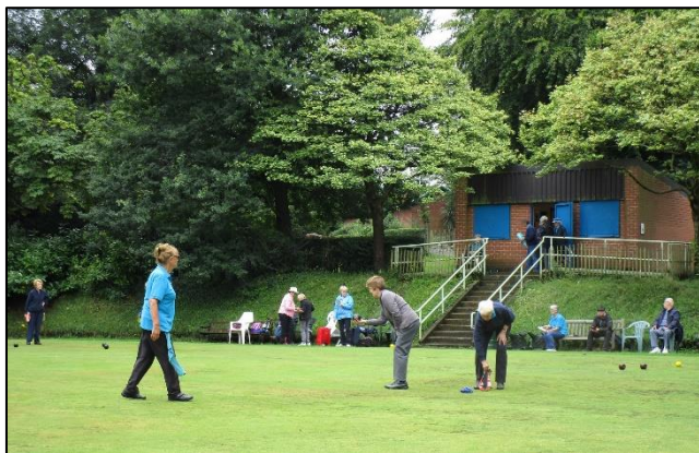
The John Leigh Park Ladies' Bowling Team meets on Wednesday afternoons in the Summer Months.